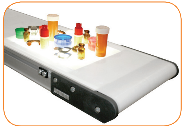
Ideal for a variety of products