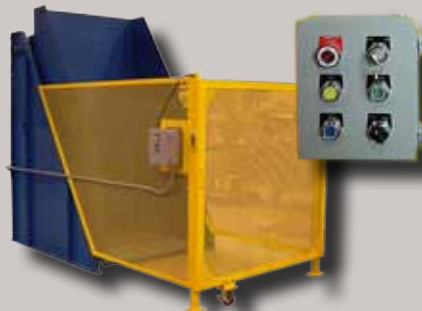
Standard Gated Enclosure - Auto Run Controls Available