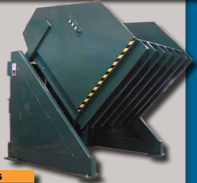
10,000# Rugged Duty Dumper