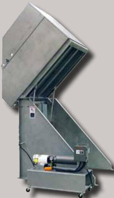
Stainless Steel Dumper