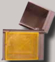
Side Load Dumper