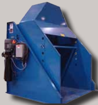
Standard Dumper with Funnel Chute