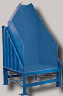
Standard Dumper with Discharge Guides and Elevation Stand