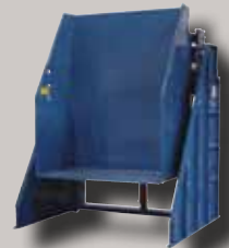
Lift and Dump