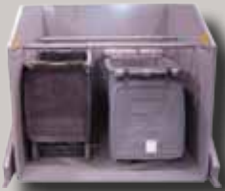
4 Place Cart Dumper