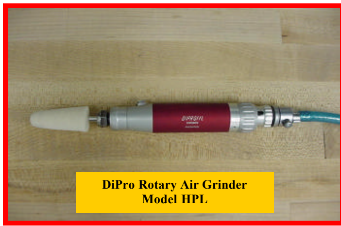
DiPro Rotary Air Grinder Model HPL

The Engis/DiProfil rotary handpiece is a precision air operated hand machine that delivers 35,000 rpm, yet weighs less than 13 oz. The piston type motor provides constant torque of 0.56 in/lbs. The chuck accommodates the supplied 3/32" & 1/4" collets. It's lightweight, rugged design makes it ideal for polishing molds & grinding dies, as a deburring tool, and other precise handworking operations.