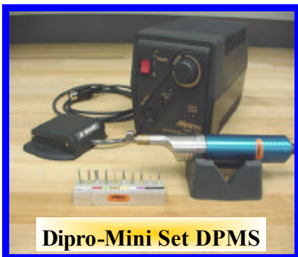
Dipro-Mini Set DPMS

Excellent value set now available from Engis or your local distributor for only $838.00 .