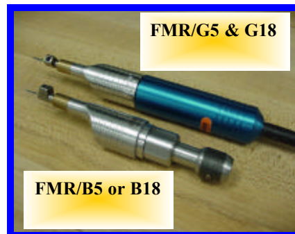
FMR/G5 & G18

Set DPMS-18 includes all of the above, however, the stroke of the Dipro Mini Filer is 1.8 mm.