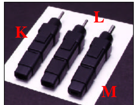
K. 1/8 x 1/2 and 1/4 x 1/4 P/N 029919 L. 1/8 x 1/4 P/N 029918 M. 1/8 x 1/4 P/N 029916

Engis ® Leaders in Superabrasive Finishing Systems