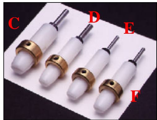
C. Holder Pro for 1/4" "Long" 3/16" shank P/N 029960 D. Holder Pro for 1/4" "Short" 3/16" shank P/N 029963 E. Holder Pro for 1/8" "Short" 3/16" shank P/N 029967 F. Holder Pro for 1 mm ceramic stone, 1/8" shank P/N 0299169