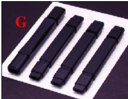
G. 4 piece hand stone holder kit. Holds round and all sizes of square and rectangular polishing stones from 1/16" to 1/2". P/N 029915