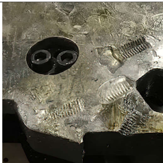
Competitor's vulnerable design allows screws to loosen and fall into the die, damaging product and other tooling.