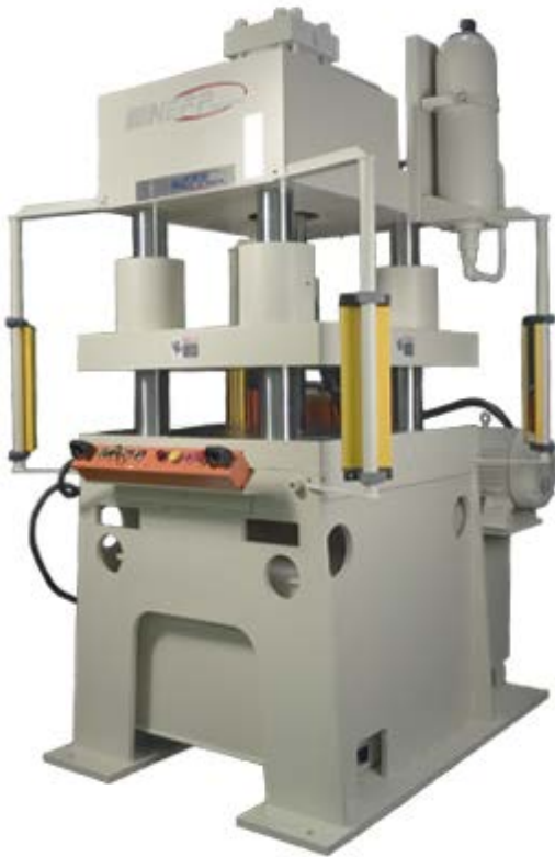
H-Series 4-Post Press

H-series presses are built to each customer's exacting specifications. Reference Table 1 (below) for specifications necessary to fit your application